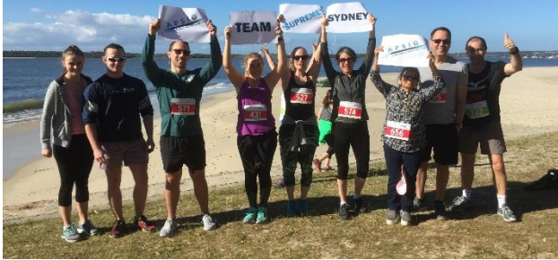
Beachside Dash for APSIG 2017

We're raising money to support our fabulous volunteer Medical Physicists who are helping set up in cancer centres in Cambodia, Vietnam and other Asia-Pacific countries.